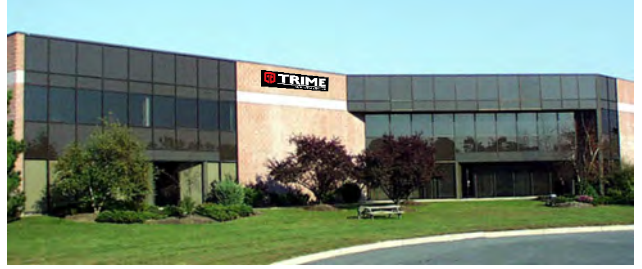
Trime - Italy